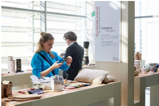
Ethical Style Spot at Ambiente.

time. The special presentations showed a curated selection of products that combined design and sustainability.