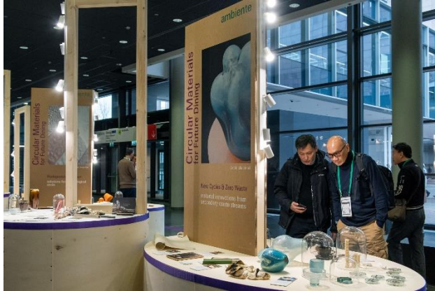
The special presentation "Circular Materials for Future Dining" focused on material development based on organic raw materials and set the tone for the future of tableware.

by the Dutch company Originalhome. The collection of handmade drinking glasses, carafes and vases was generated from upcycled wine bottles in Zanzibar. There, due to a lack of recycling systems, a lot of tourist waste ends up in the sea or on the rubbish. The international company of a group of independent professionals used their know-how consciously and returned waste to the cycle.